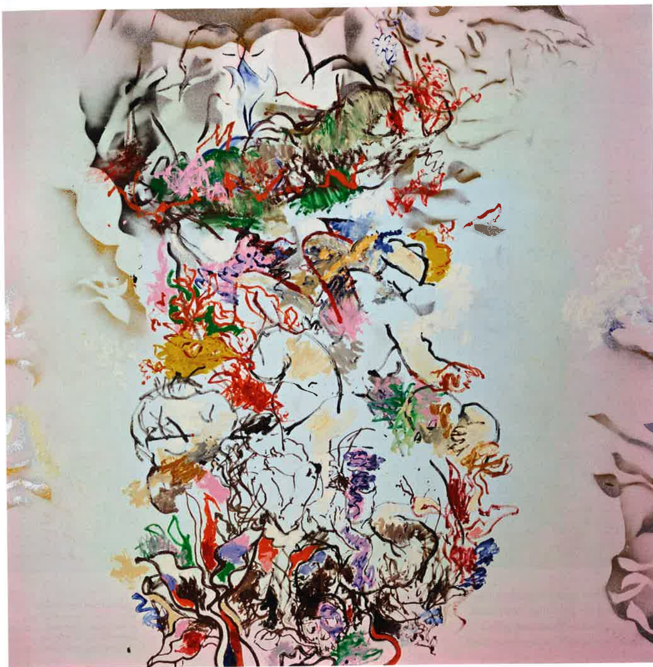
↑ Painting, 2011 (5-12, 11) Oil-based pigments on linen 108" by 108"