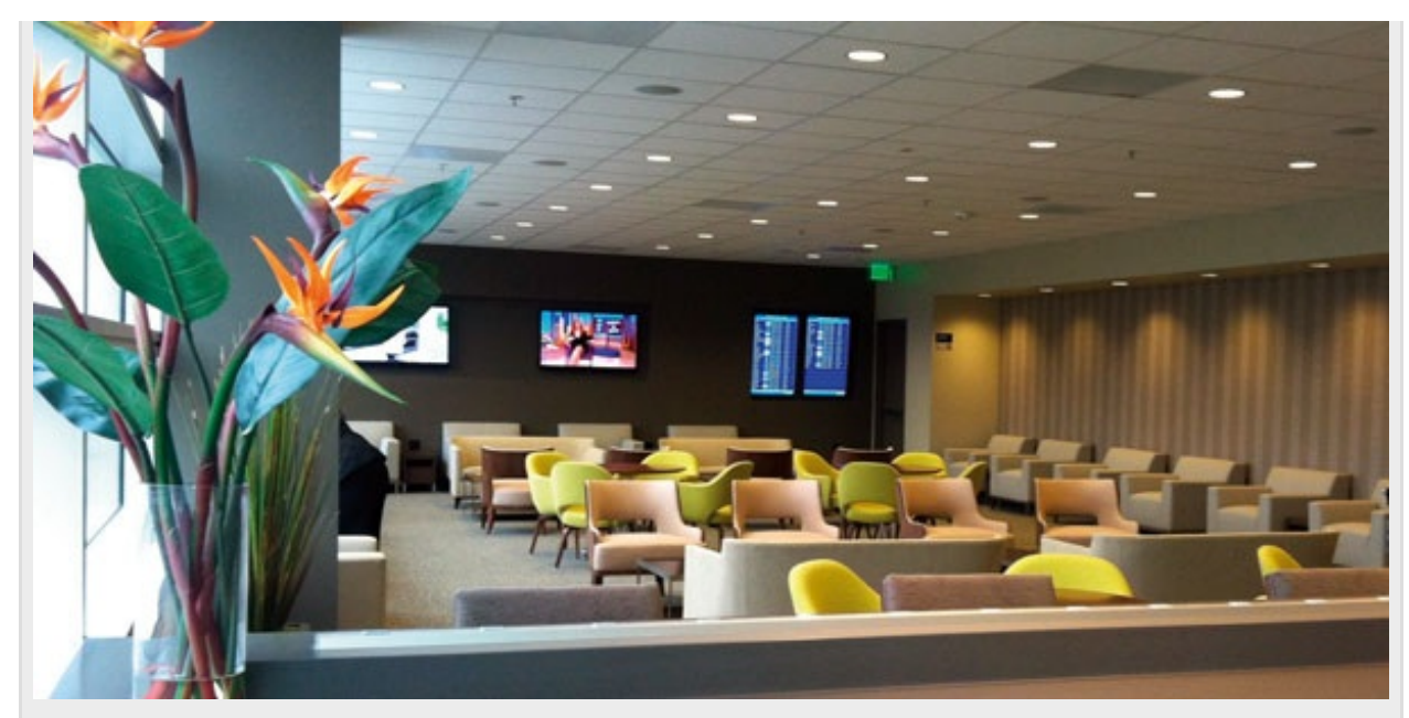
All travellers passing through San José International Airport can experience its newly opened The Club at SJC lounge for a day's admission fee of $35. The Club, which has seating for 128 passengers, is the first lounge the airport has opened since 2010.

Mineta San José International Airport (SJC) has made the VIP air travel experience possible for every passenger with the opening of its The Club at SJC airport lounge. All travellers at the airport have access to the lounge regardless of what carrier they are due to fly on or what class of ticket they have purchased; all they need do is acquire a day's pass to the lounge for $35 ( \in 26).