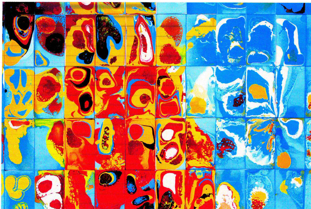
Ian Harvey + Koo Kyung Sook, Figure 2 (detail), 2007, Enamel and shellac on paper, 112 x 132 inches, Courtesy of the Artists and JAYJAY, Sacramento, CA.

SAN JOSE, CA.- size matters insofar as it tells us something about an object's dimensions in relationship to other things. We understand the difference between what is small versus what is big due to a comparison between them. While our understanding of size is intrinsically tied to human scale, science and technology have opened new perspectives into the cosmic and infinitesimal, dramatically altering the way we understand ourselves in relation to an expansive universe. In organizing size matters we selected work that speaks to the conceptual and physical reaches of size. From the monumental to the microscopic, the ten contemporary artists create work in various proportions and forms and utilize scale to challenge and shift our perception of the world around us.