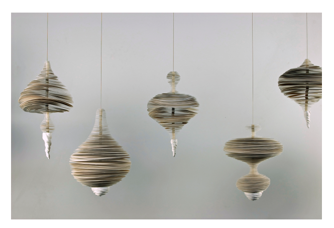
NextNewPaper June 5 – September 18 Main Gallery

In this iteration of the NextNew series, 19 Bay Area artists use paper as their medium, creating works that highlight the endless ways that this seemingly innocuous material can be manipulated.