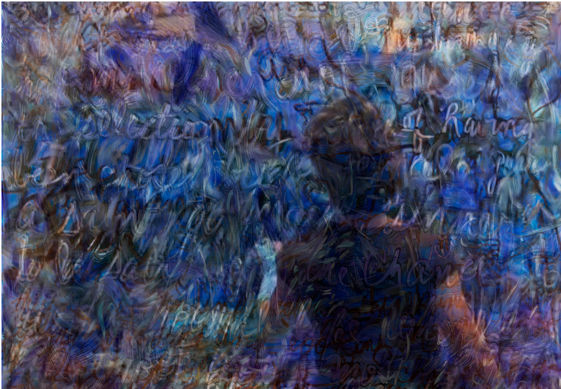
Naomie Kremer, Chance Operations , 2011, oil on linen and video projection, 44 x 58", Courtesy of the artist and Modernism.