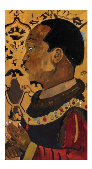
Special exhibition tour: William Kentridge "In Praise of Shadows" at The Broad