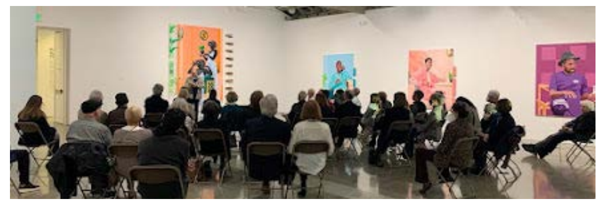
David Pace Gallery dedication reception