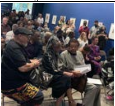
Launch of fall exhibitions at SJICA