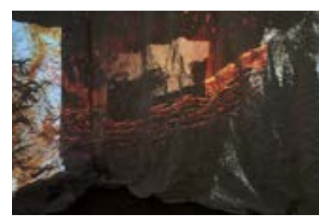
Facing West Shadows @ICA San José