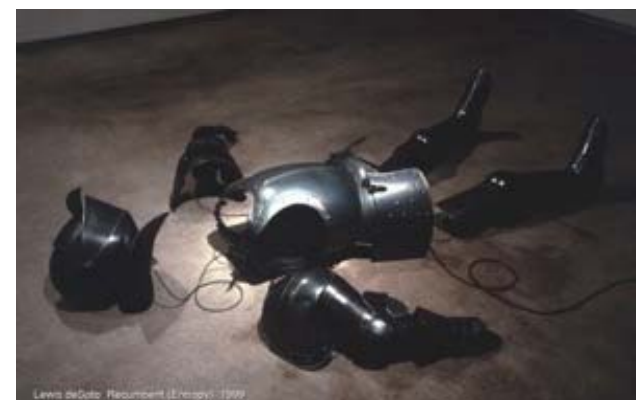
Recumbent (Entropy), 1999, steel, electronics, 9 x 84 x 16 inches