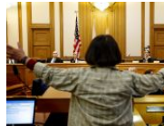
Google bus backlash: S.F. to impose fees on...