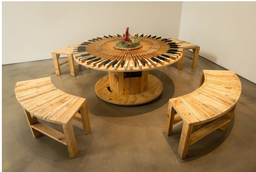
Terry Berlier's "Where the Beginning Meets the End" (2013), 88 piano keys, Mac mini, keyboard microcontroller, wire, wire nuts, wood spool, wood, copper pipe, screws and speakers.