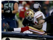
Bowman's injury on heroic play devastated...