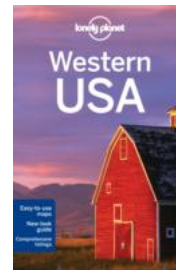
Western USA 1 Balfour, Amy