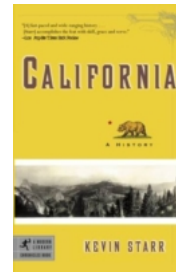
California: A History Starr, Kevin

San Jose has long been known as a centre for the forefront of cultural innovation, and once