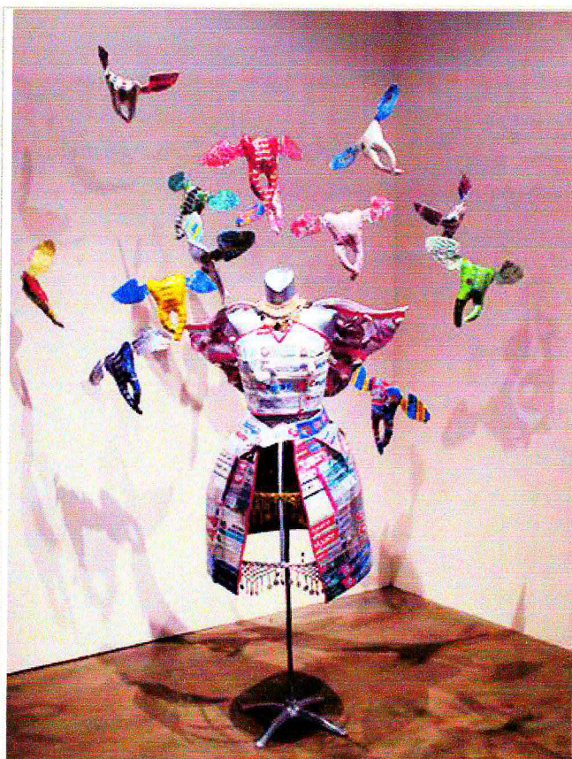
Charlotte Kruk, "An Even Exchange", 2009, tooth paste tubes, packaging, brushes, dental floss, fabric, plastic and human teeth on dress form, 30 x 28 x 15"

here. Her goal, then and now, wasn't to make a political statement; it was to showcase artists who were deeply engaged with their materials. That such engagements light up social, political and environmental themes without being swamped by ideology demonstrates how really good, socially relevant art can spring from relatively narrow (and often highly idiosyncratic) personal investigations. As such, Afterlife may be the perfect antidote to another credit-flexing, landfill-breeding holiday season.