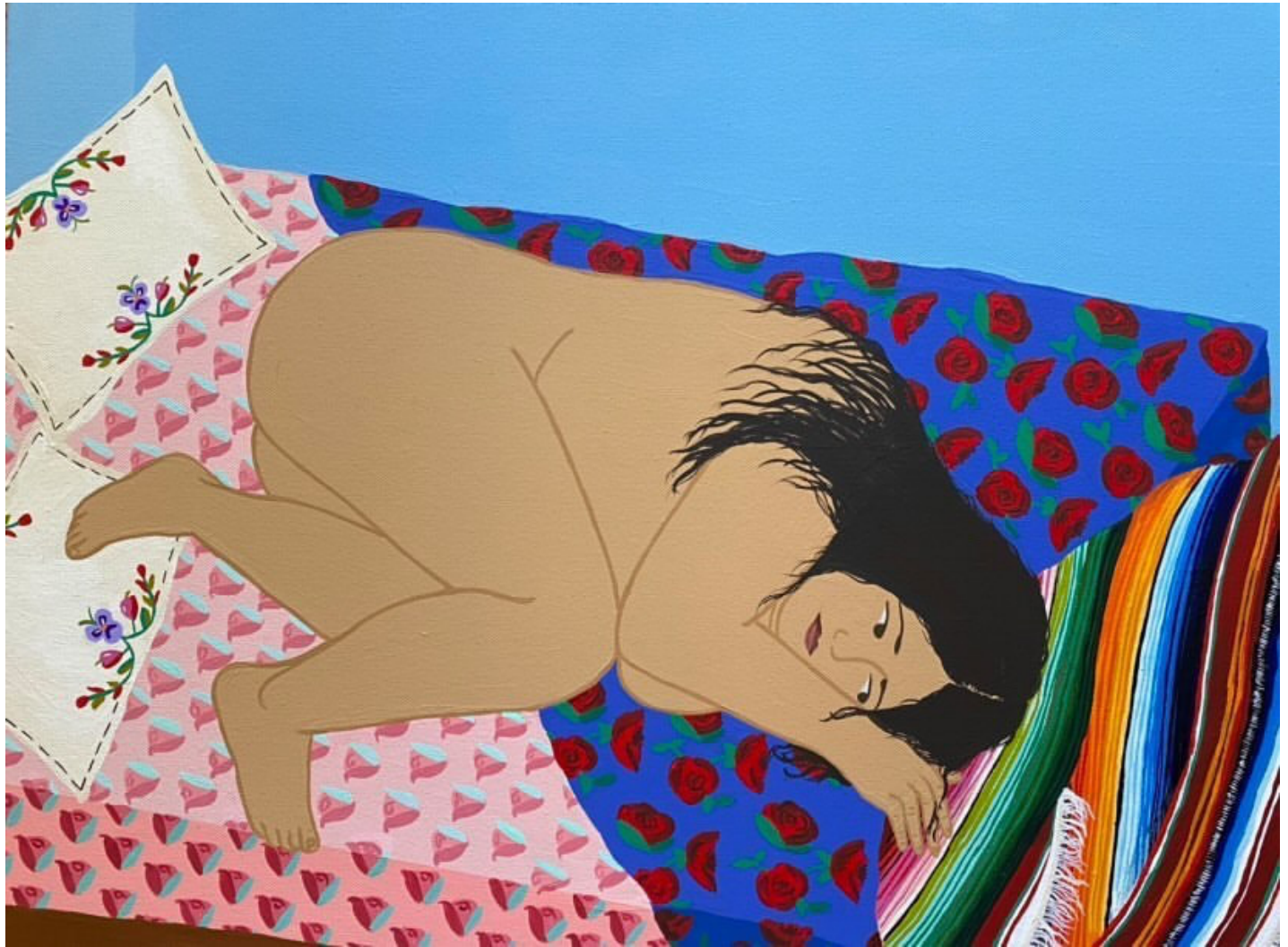
Gina Contreras, 'La Lonely,' 2021; Acrylic and gouache on canvas. (Courtesy the artist)

show encompasses documentary-style photographs, scenes of Black domesticity, staged reckonings with structures of power, lyrical video work and powerful combinations of image and text. It's especially fitting to revisit this work (or see it for the first time) in the Bay Area, where Weems lived on and off during the '70s and '80s, participating in Anna Halprin's San Francisco Dancers' Workshop and studying folklore at UC Berkeley.