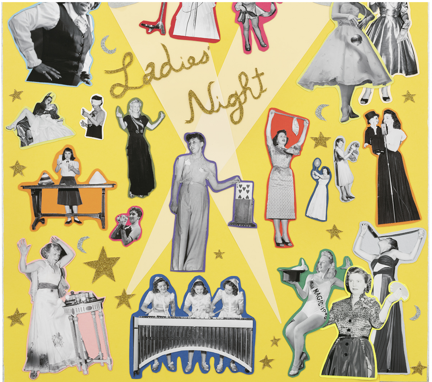
Lindsey White, 'Ladies Night,' 2021; Digital fiber print, paper, collage.