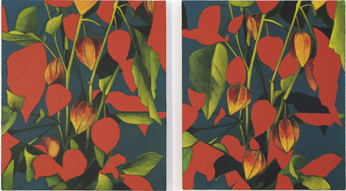
Ryan Mrozowski, 'Untitled (Pair),' 2021; Acrylic on linen.