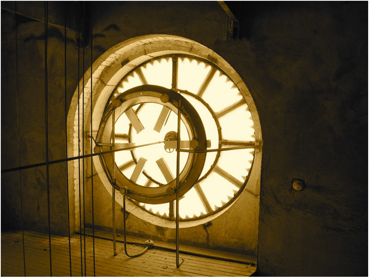
The setting for Trevor Paglen's 'Beta Space' sound installation: the San Jose Museum of Art's 19th-century clocktower.