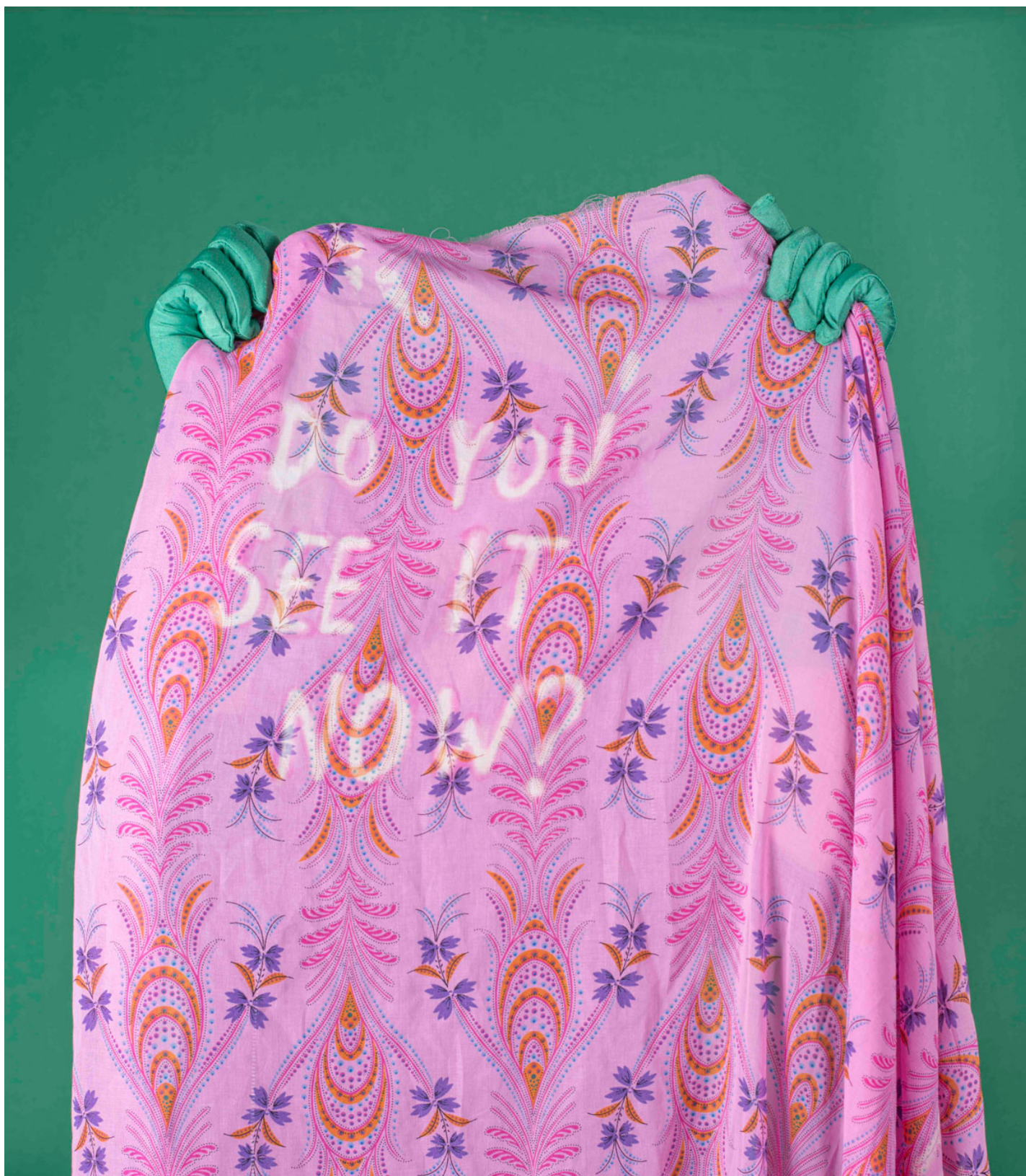
Farah Al Qasimi, 'It's Not Easy Being Seen 3,' 2016; archival inkjet print.