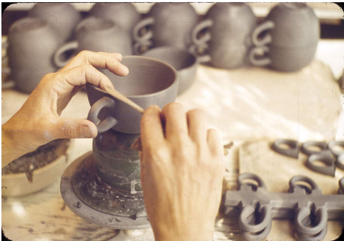
'Untitled (Finishing a Teacup Edited),' c. 1970; photographic print from the Edith and Brian Heath Collection in the Environmental Design Archives, UC Berkeley.