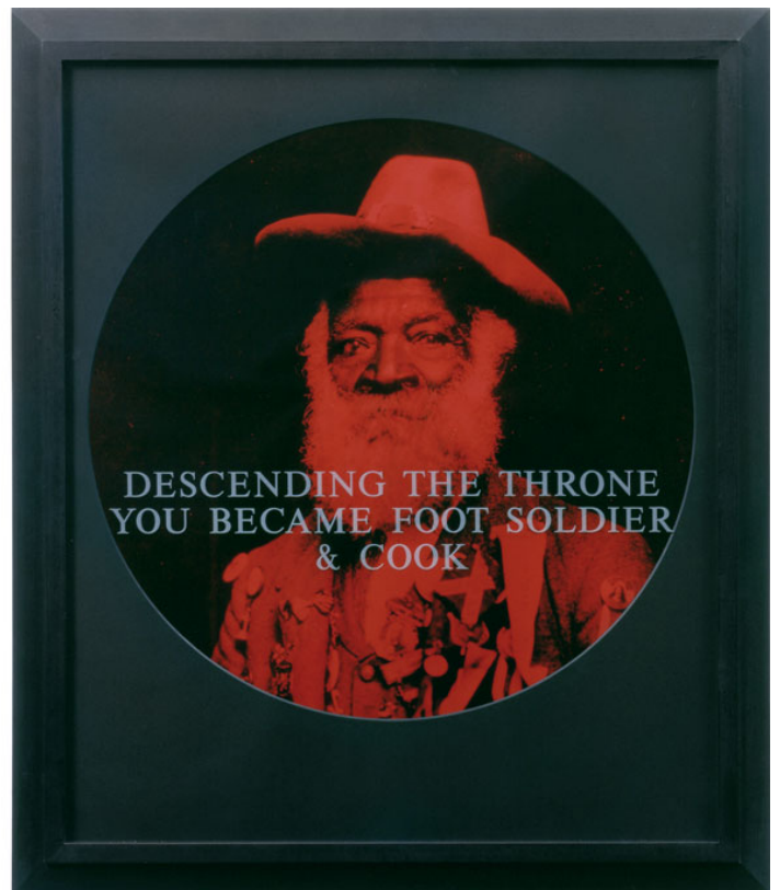
Carrie Mae Weems, 'You Became Mammie, Mama, Mother, Then, Yes, Confidant-Ha/ Descending the Throne You Became Foot Soldier & Cook,' 1995–96; Chromogenic print with sandblasted text.